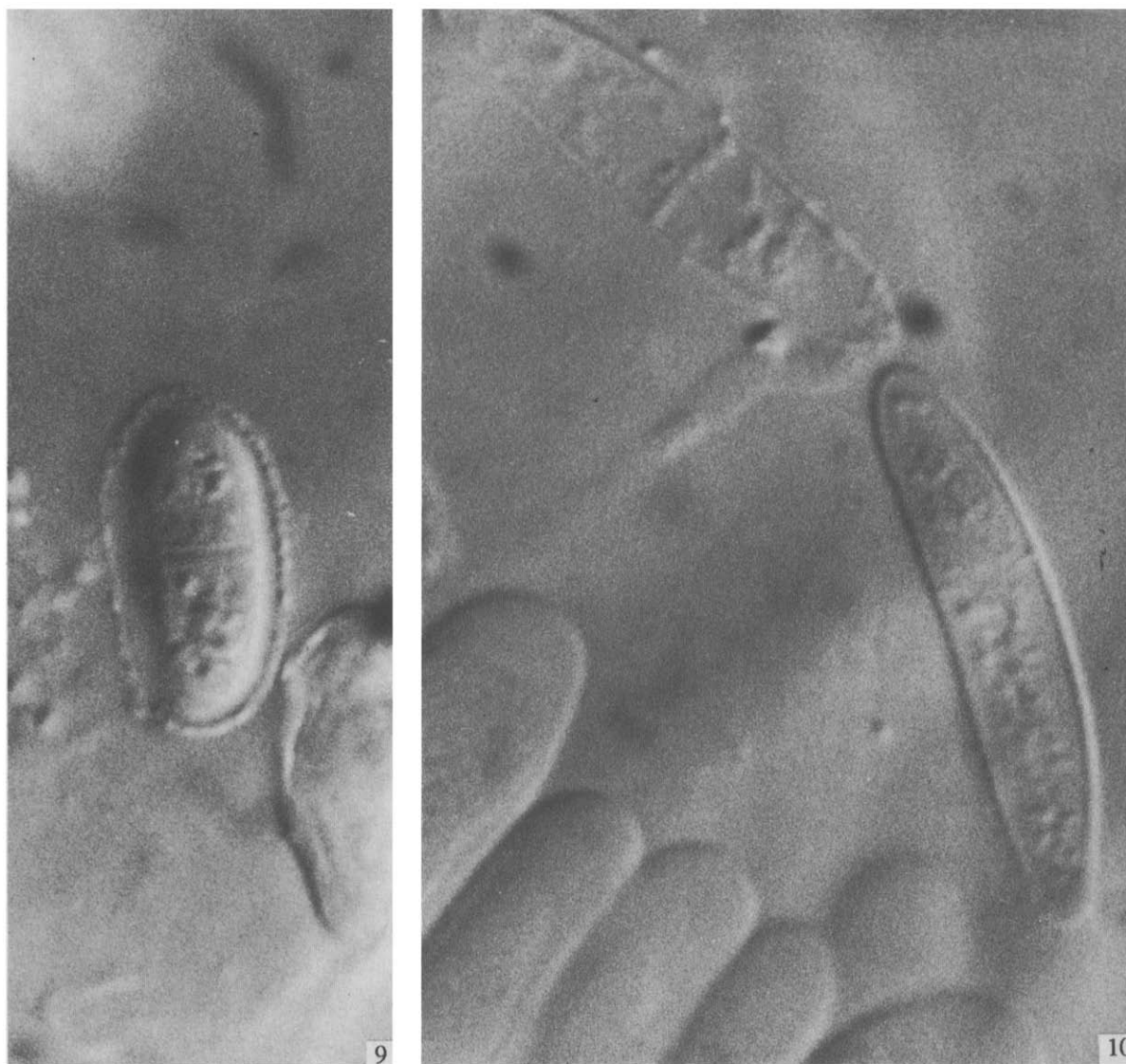
Fig. 9. Ascospores of Klasterskya acuum , \times 3200 . Fig. 10. Ascospores of Pyxidiophora crenata , \times 3200 .

460–720 \mu\text{m} long including the fimbriate ostiolar hyphae, composed of parallel cylindrical cells, dark brown, 45–60 \times 4.5–5 \mu\text{m} , thick-walled (1.5–2 \mu\text{m} ); ostiolar hyphae fimbriate, hyaline to light brown, 14–22 \times 3–4 \mu\text{m} with acute apex. Paraphyses lacking. Asci unitunicate, 8-spored, ovoid to broadly clavate, 20–25 \mu\text{m} diam, shortly stipitate, evanescent, non-amyloid. Ascospores elliptical to cylindrical, 1-septate, hyaline, smooth, 13–17 \times 5–6 \mu\text{m} , surrounded by a hyaline gelatinous sheath, discharged in gummy masses in a long tendril. Conidia unknown.