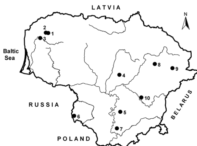
Fig. 1. Location of the study sites in Lithuania: 1 – Kreiviškės, 2 – Plikoji sala, 3 – Minijos kilpa, 4 – Šilas, 5 – Gojus, 6 – Drausgiris, 7 – Subartonys, 8 – Ažuolija, 9 – Ginučiai, 10 – Dūkštos

stands of various age groups from maturing (50–120 years) to mature (over 120 years). Depending on the size of a study site, from one to nine circular study plots of 0.1 ha were randomly selected. In total, we surveyed 50 plots.