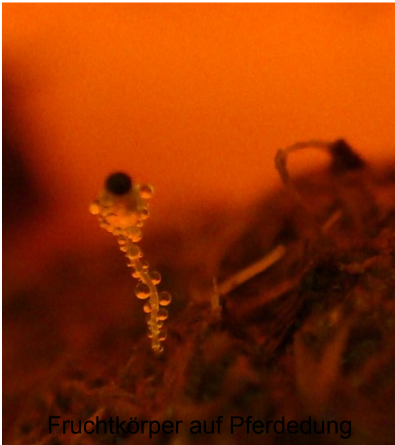
Fruchtkörper auf Pferdedung