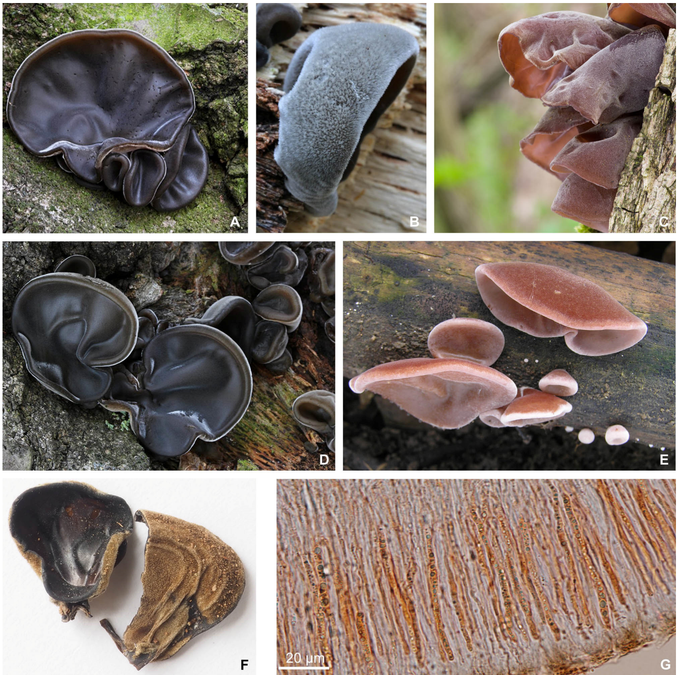
Figure 3. Comparison of Auricularia species: (A,B,D) Basidiocarps of A. cerrina in field (holotype), photo L. Hejl; (C) A. auricula-judae in field (LZ 1804), photo L. Zíbarová; (E) A. auricula-judae in field (LZ 0612), photo L. Zíbarová; (F) Dried specimen of A. cerrina (part of holotype); (G) Hymenium of A. cerrina (holotype).

Basidiocarps gelatinous in a fresh condition, begin as slightly cupulate and develop into an auricularioid shape, sometimes slightly retracted to the centre, attached in one point to the substrate, single or caespitose, projecting up to 40 mm in diameter and 1–4 mm in thick, thinner on the margins, dark greyish. Abhymenial surface azonate, dense, hirsute, hairs single or arranged in tufts, thick-walled along the entire length attenuated under tips, with visible lumen, apically obtuse, without a remarkable swollen base, only slightly widened, smooth, hyaline, occasionally pigmented on the base, 125–250 µm long, 5–7 µm in diameter, up to 11 µm width on the base, forming a whitish to greyish hairy layer that is