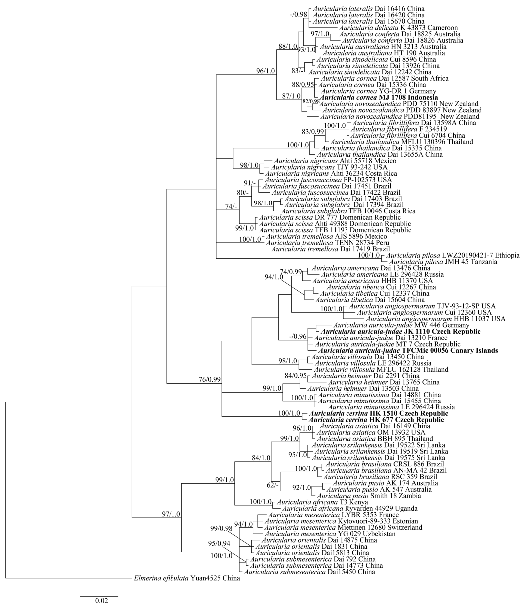
Figure 2. Bayesian phylogenetic tree (ITS region) of the selected specimens of Auricularia . Sequences generated in this study are in bold. Maximum likelihood bootstrap support and Bayesian posterior probability are shown.