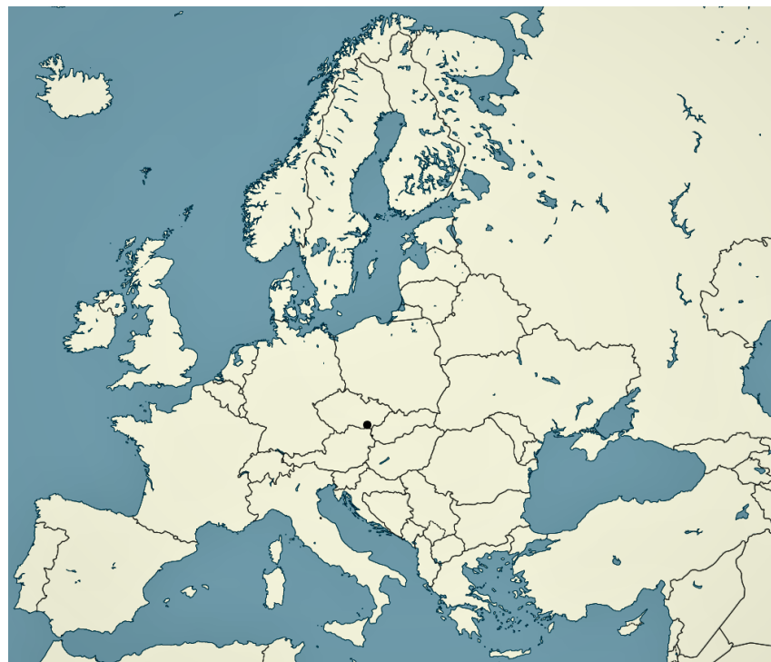
Figure 1. Location of the type locality of A. cerrina in the Czech Republic (black dot).

A new species is described from the Rendezvous National Nature Monument near Valtice in the Czech Republic (Figure 1). The type locality is covered by an oak ( Quercus spp.) with thermophilous forest ( Quercetea pubescentis ) as a main biotope.